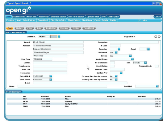
Account information screen

Completely scalable from single user, to multi-user, to multi-site national organisations, the Core system is the essential platform for successful brokers.